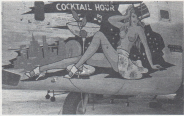
Michigan, 44-40429, and Cocktail Hour, were painted by the greatest combat artist of the war. (Stewart N. Bolling)