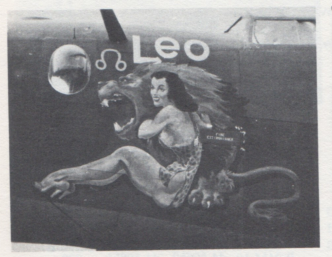
Leo, 41-29605, a B-24H-15-FO from the Zodiacs, the 834th Squadron of the 486th Bomb Group. The other eleven planes in the unit were decorated with equally liberal interpretations of the stars.