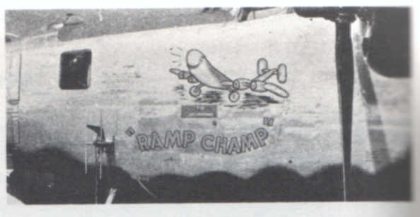
Ramp Champ, 44-41996, a B-24M-10-CO. This black-bellied ship flew with the 3rd Photo Recon Squadron from the Marianas in June 1945, as a part of XXI Bomber Command.