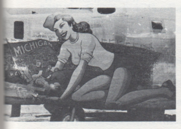
44-40428, both B-24J-161-COs from the 43rd Bomb Group. Their billboard decorations

When a change was made in a model which did not justify a new model designation, there was a change of "block number" for the aircraft production batch effected by the change or changes. Many of the modifications had filtered back to the production line as a result of combat experience, but there