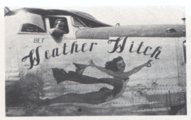
Weather Witch, a B-24L-11-FO specially modified for the 55th Recon Squadron (long Range Weather) and based on Guam.