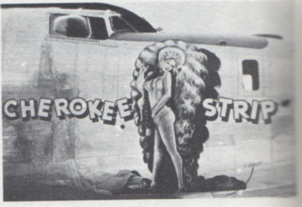
Cherokee Strip, an F-7B from the 20th Combat Mapping Squadron; this model differed from the F-7A by having all its six cameras located in the bomb bay. (E. P. Stevens)